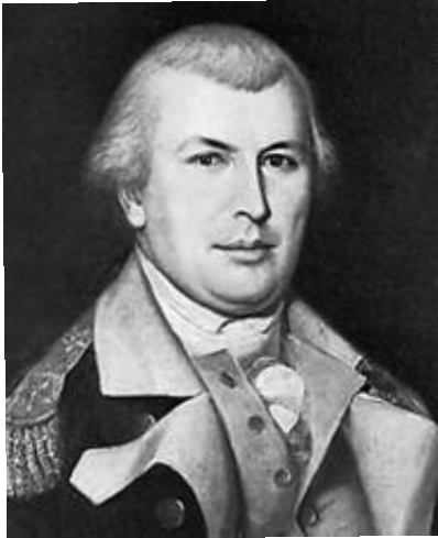
Nathanael Greene, portrait by Charles Willson Peale, c. 1783

George Washington's close friend and most-trusted general, Major-General Nathanael Greene never won a major battle as Commander of the Southern Continental Army yet won the war. Born into a Quaker family in Potowomut, Rhode Island on July 27, 1742, Greene, despite Quaker restrictions on extensive learning, was a self-educated man and an avid reader interested in studying mathematics and law, but his true calling was military science. This passion led to his eventual disownment by the Society of Friends after he attended a military parade in Connecticut and openly supported armed rebellion against England.