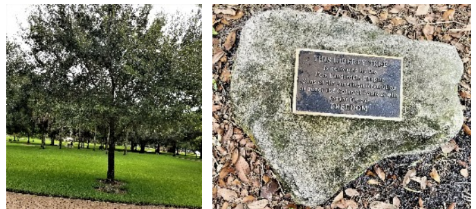
Fort Lauderdale Chapter Plantation Liberty Tree & Plaque