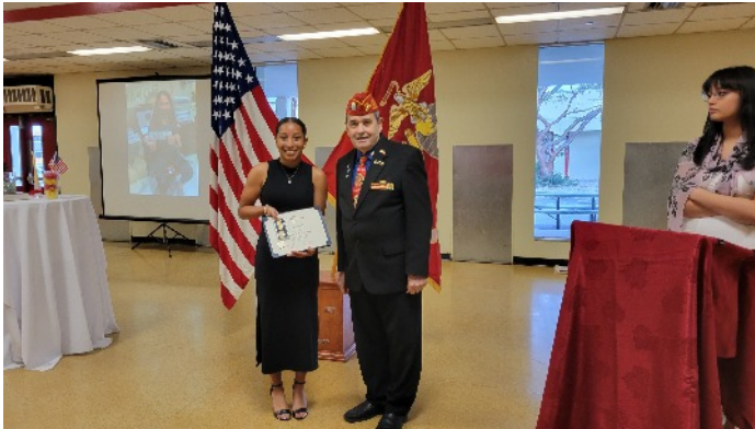
Our JROTC award presented to a cadet from Deerfield Beach High School.