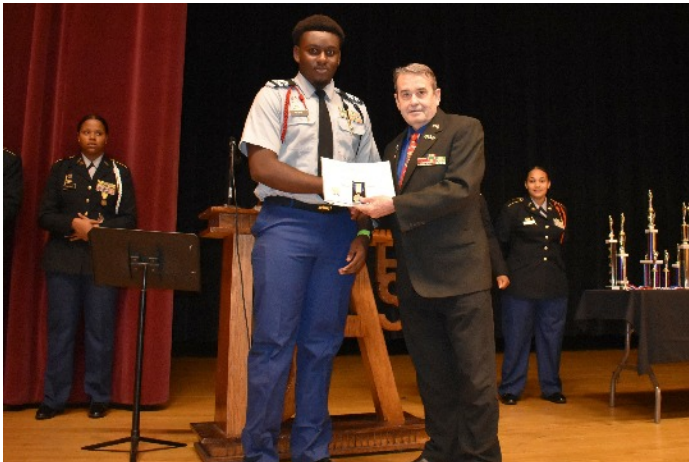
Our JROTC award presented to a cadet from Boyd Anderson High School.