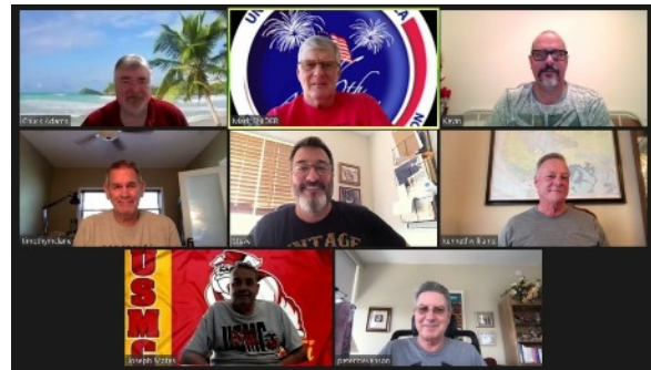
Fort Lauderdale Executive Committee Members Present - February 11, 2024 ZOOM Meeting.