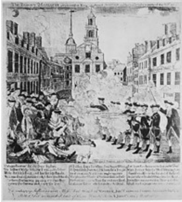
The Bloody Massacre Perpetrated in King Street, Boston, on Mar. 5, 1770

On the evening of March 5, 1770, British soldiers and American colonists clashed in a cardinal event that has come to be known as the “Boston Massacre” – an event upon which “the foundation of American independence was laid” (Adams, John).