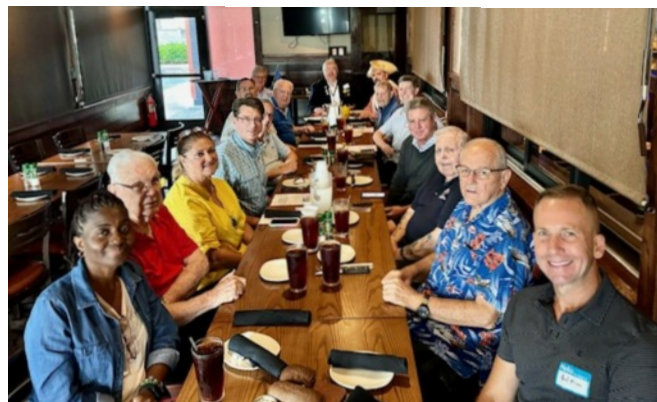
July 27, 2024, Fort Lauderdale SAR Lunch Group