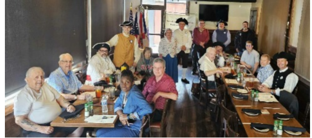
September 21, 2024, Fort Lauderdale SAR Lunch Group

To read the complete set of the minutes of the general members meeting held on September 21, 2024, open the document sent to you by e-mail, or review it at the archive's subpage for minutes and agendas which are maintained at the Chapter website: www.fortlauderdale.sar.org .