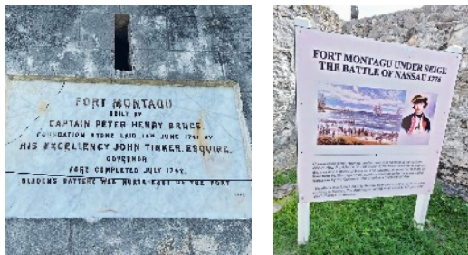
Fort Montagu Battle of Nassau Presentation Board which reads as follows:

“Commodore Ezek Hopkins landed over 200 soldiers at the eastern end of New Providence on 3rd March 1776. They had come to capture the munitions stored at Nassau. The Governor ordered that 3 shots be fired from Ft. Montagu as his soldiers retreated to Fort Nassau. Upon surrender by the Governor, The Americans hoisted their flag.