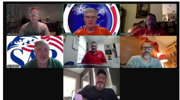
See the "President's Message" for the complete report.