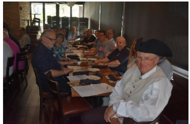
At the June 17, 2023, General Membership Meeting, in attendance were 24 Compatriot members and 10 guests, including two prospective new members.